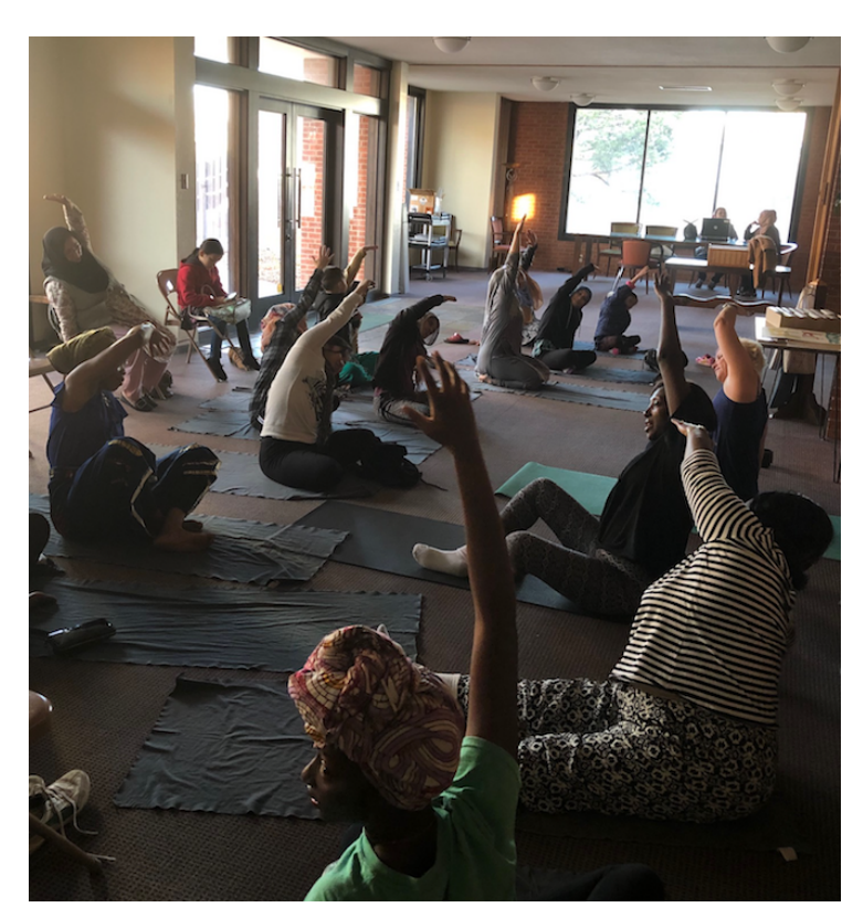
Yoga class before the COVID-19 pandemic