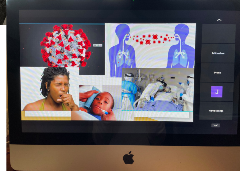
COVID-19 infection prevention information Zoom class