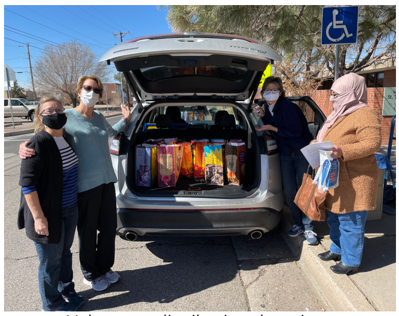
Volunteers distributing donations

of the women we serve are heads of households, have never attended school, and have large families with up to 11 children.