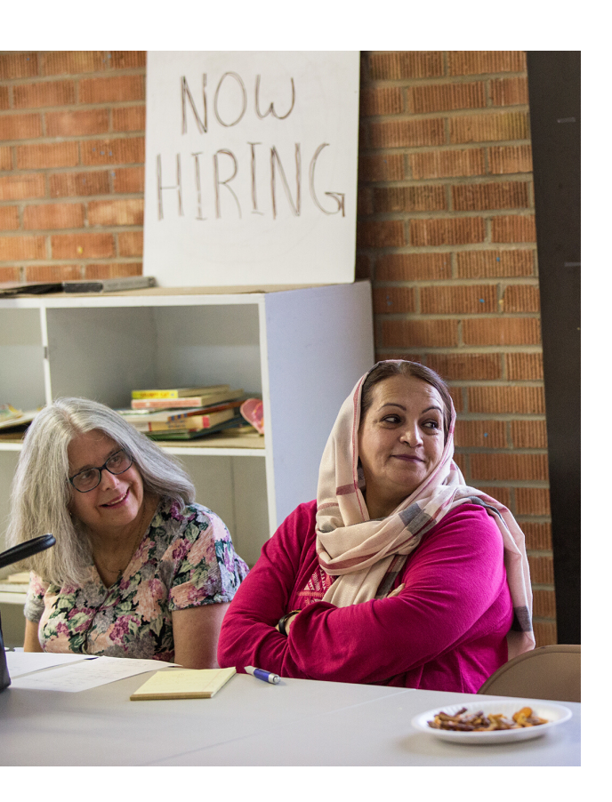
Umoja Abq's Location and contact information:

St. Timothy's Lutheran Church: 211 Jefferson St. NE